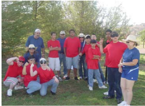
Participant of the DARS – DBS Camp for the Blind